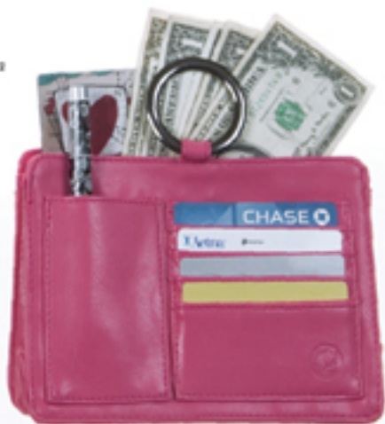
pouchie purse organizer $26