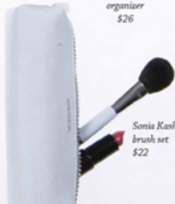
Sonia Kashuk brush set $22