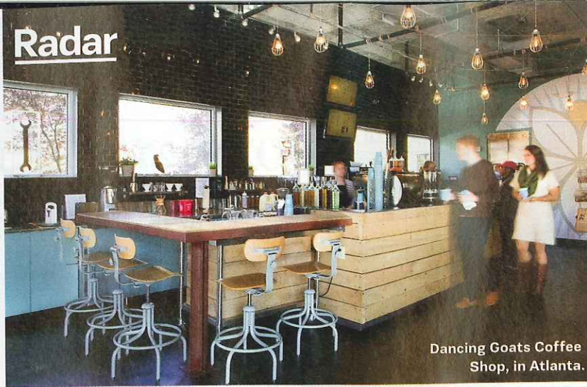
Dancing Goats Coffee Shop, in Atlanta.