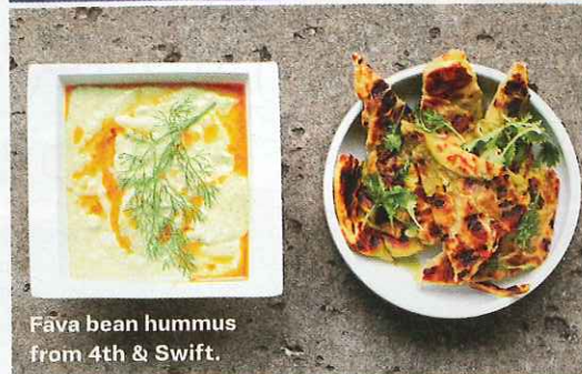
Fava bean hummus from 4th & Swift.